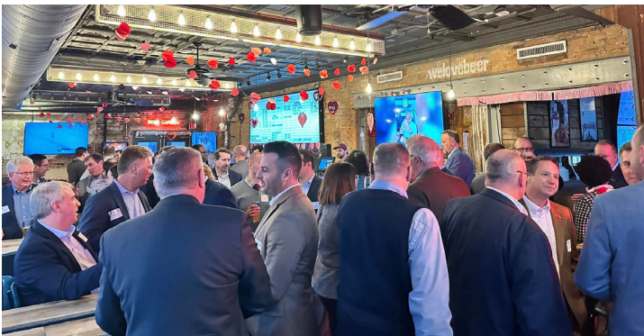
February 9, 2024 · PAC kickoff event at BrewDog.