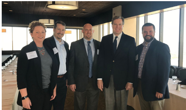
Congressman Mike Turner ($5,000)