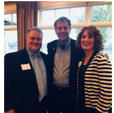
Senator Sherrod Brown ($4,000)