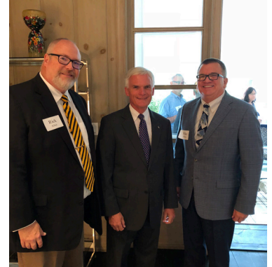
Congressman Bob Latta ($2,000)