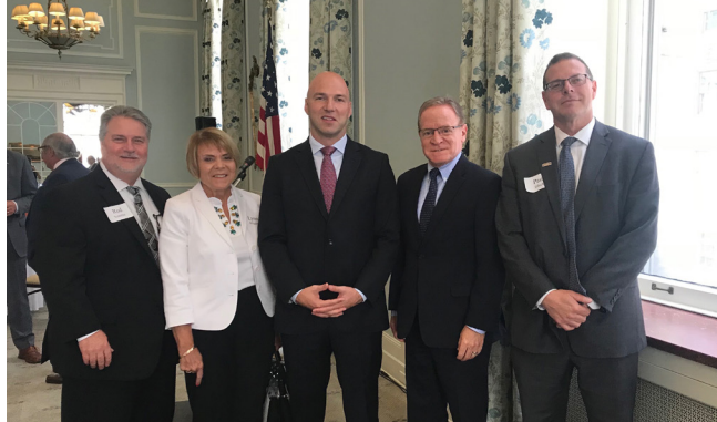
Congressman Anthony Gonzalez ($4,000)