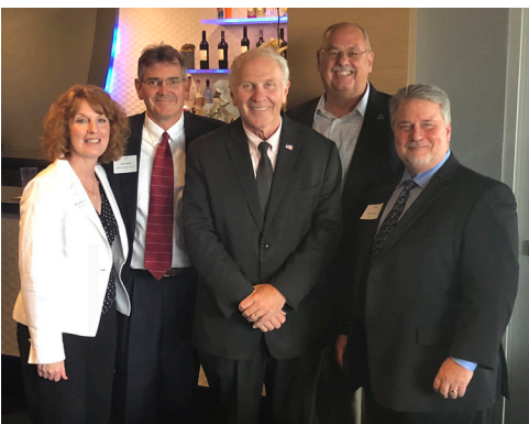
Congressman Steve Chabot ($5,000)